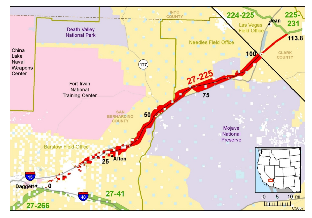
Figure 1. Corridor 27-225

Corridor 27-225 (Figures 1 and 2) extends from the junction of Corridors 27-41 and 27-266 near Daggett, CA, to the intersection of Corridors 224-225 and 225-231 in the southern part of Clark County and south of Jean, NV. Federally designated portions of this corridor are entirely on BLM-administered land, with a 10,560-ft width in CA and a 3,500-ft width in NV. The corridor follows a previously designated corridor in California but uses the default 3,500-ft width in Nevada, where it was not designated. Corridor 27-225 is designated as multi-modal and can therefore accommodate both electrical transmission and pipeline projects. The corridor spans 113.8-miles, with 83.8 miles designated on BLM-administered lands. The corridor's area is 106,603 acres or 166 square miles. This corridor is and under the jurisdiction of the BLM Needles and Barstow Field Offices in California and the Las Vegas Field Office in Nevada. The corridor is also entirely in Region 1.